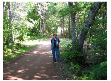
Lover's Lane in Cavendish