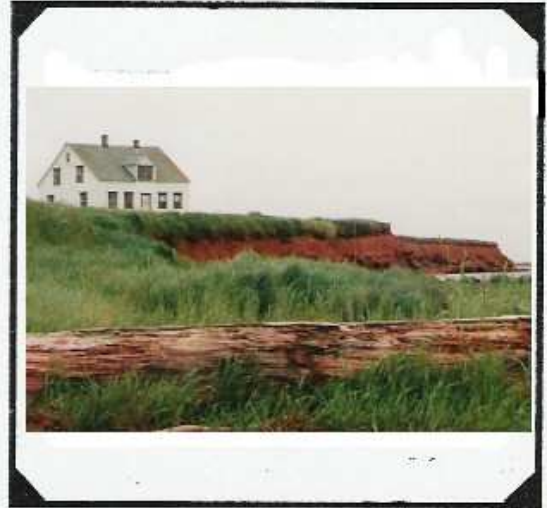
"New Moon," Fox Point, Malpeque, PEI

Carolyn walked over to the set but had to view it from afar as no visitors were being allowed in at the time. Let's hope US television picks up the Emily series so we can see it here.