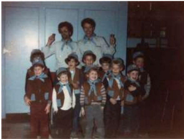
Norval Cubs – 1981