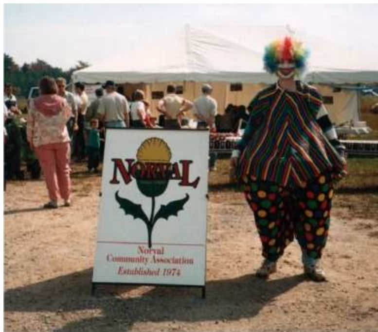
Oktoberfest - Norval