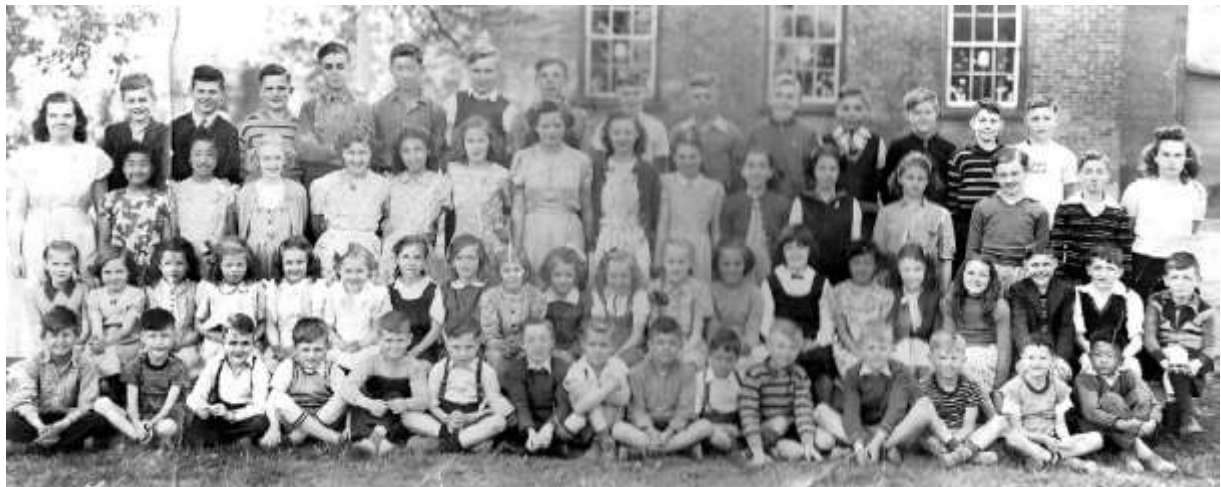
Norval Public School - 1940