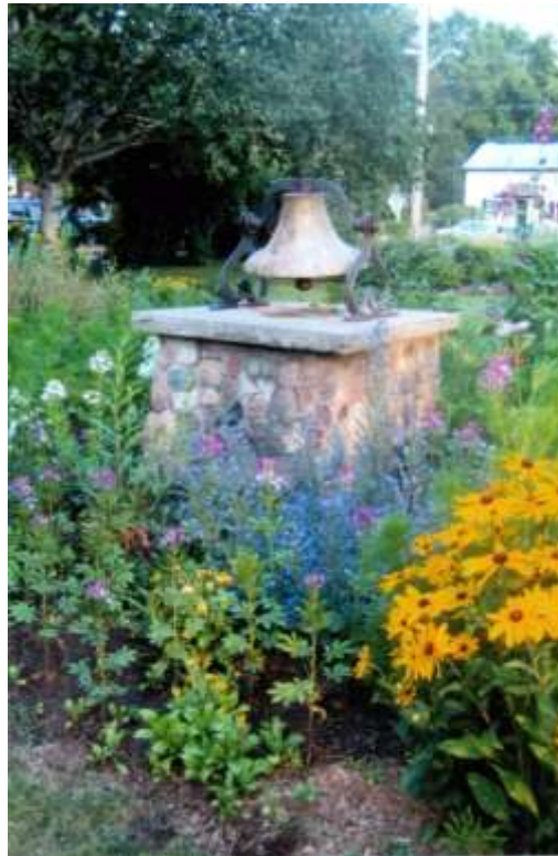
Norval School Bell