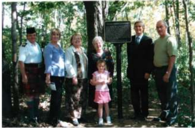
McNab Pioneer Cemetery