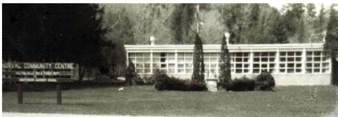
Norval Public School