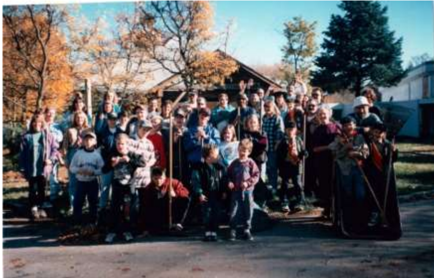
Norval Clean Up Day 1990

More recently, Norval citizens have hosted many special events such as Riverfest, Anne of Green Gables Day, annual Montgomery Christmas celebrations, NCA's President's Garden Party, May 24th Parade, Canada Day, Georgetown Horticultural Society's Garden Tours, celebration fireworks, weddings, and sports events.