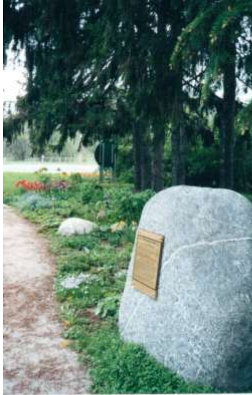
Norway Spruce Trees in Norval Park - 2014

The row of “Norway Spruce trees” along the property line of “Lilac Lawn” (475 Guelph St.) and the Norval Park boundaries were planted by the students of Norval Public School in the early 1940s.