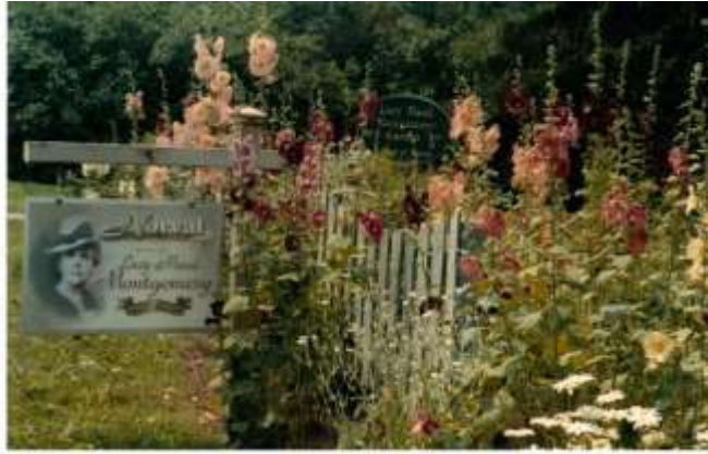
Lucy Maud Montgomery famous Hollyhocks