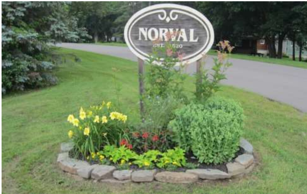
Norval Gateway Signage