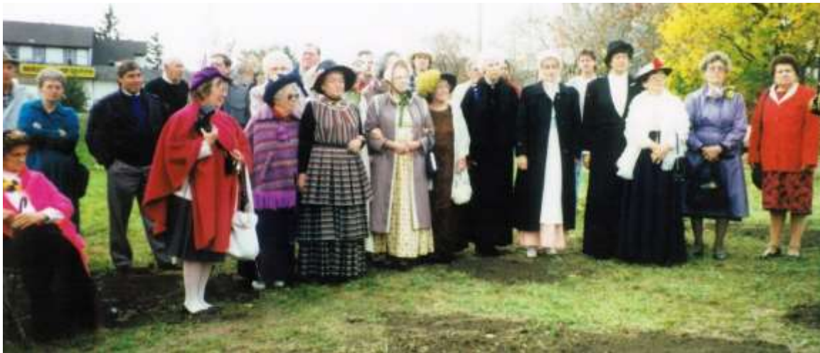
Norval Women's Institute – McNab Park Unveiling 1991

Perhaps the active, contributing, celebratory nature of Norval's people dates all the way back to Lady Tweedsmuir's suggestion, in the mid-1930s, that Women's Institute branches in Canada follow the example of their English counterparts and keep detailed local history books. WI members had been recording the names of early settlers and details of agricultural practices since the 1920s, but the cachet of a request from the Governor General's wife, herself an active WI member, was most encouraging. Even all these years later, the people of Norval are still heeding the call, remaining strongly interested in the life of their village.