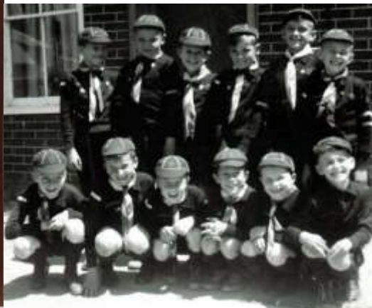
Norval Cubs - 1955