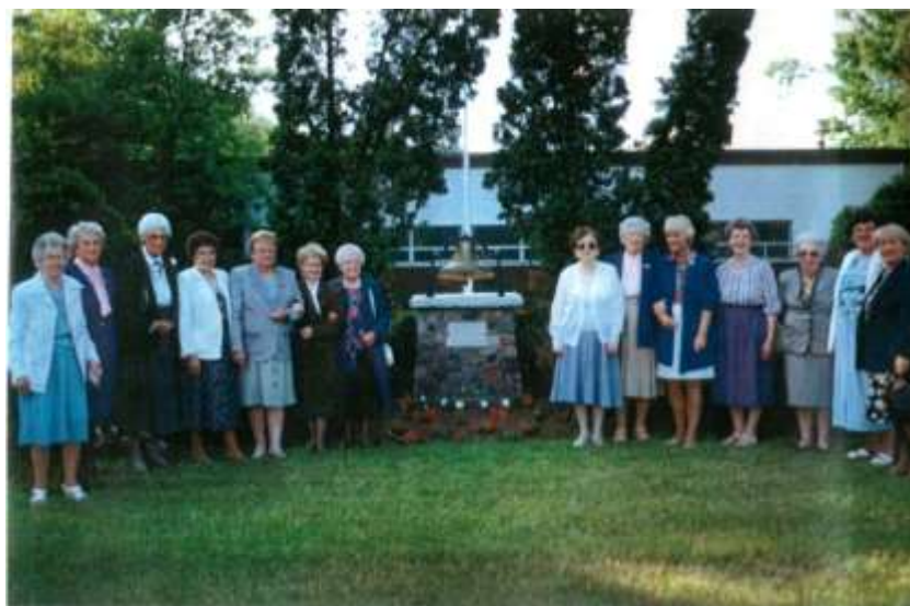
Norval Women's Institute 1995