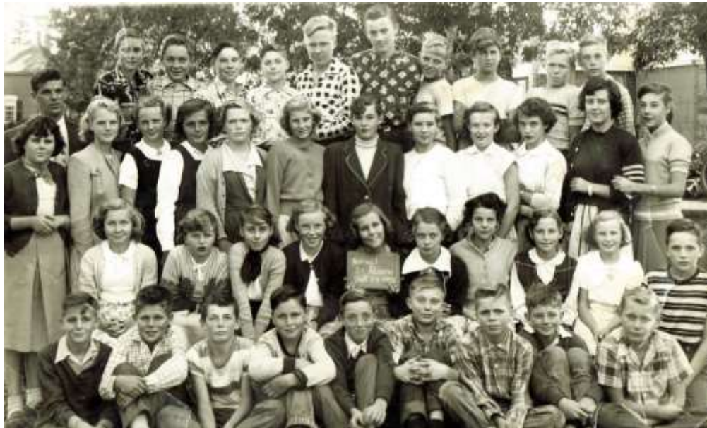
1953 First Students at Norval Public School Junior and Senior Classes

The new Norval School was built in the early 1950s, but with declining enrolment in the early 1970s, the Esquesing School Board was forced to close the school, in 1974. This closure precipitated the founding of the Norval Community Association (NCA), which was instrumental in keeping the Norval School building available for community activities and events.