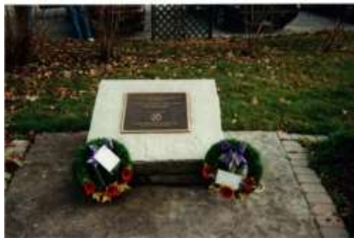
Analemmatic Sundial Plaque