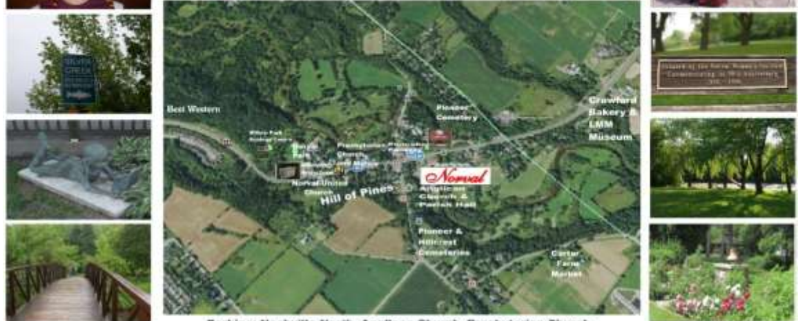
Parking: Nashville North, Anglican Church, Presbyterian Church, United Church, Mary Street and McNab Park