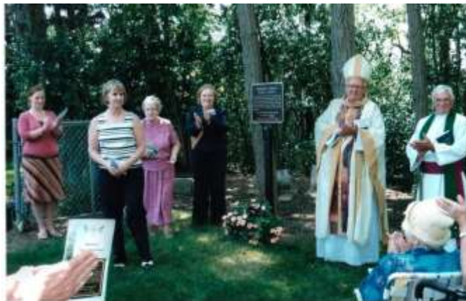
St. Paul's Anglican Pioneer Cemetery